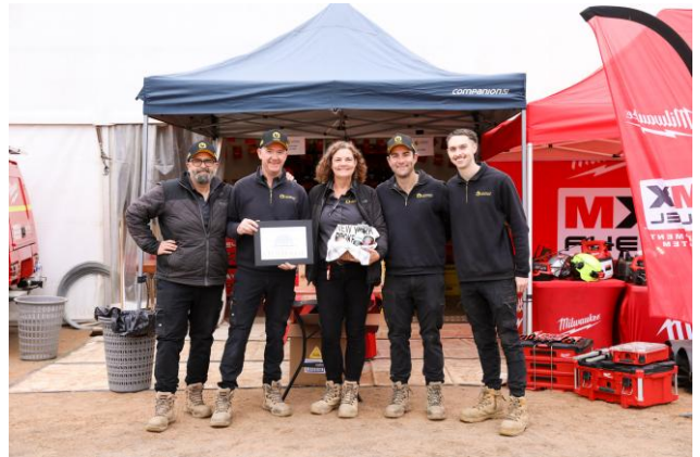
Best Outdoor Exhibitor Lawrence Industrial Supplies