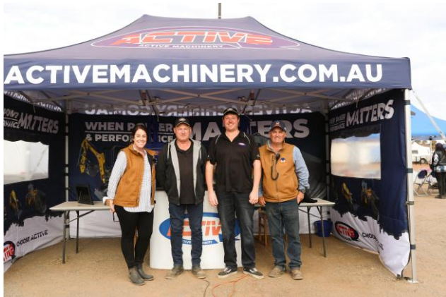
Best Commercial Exhibitor Active Machinery