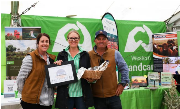
Best Indoor Exhibitor Western Landcare NSW